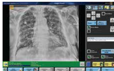
Tube and Line Visualization