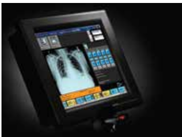
Remote Operations Panel